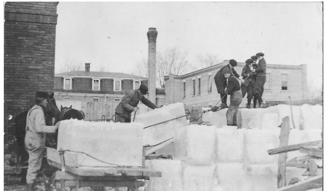
Harvesting Ice from the Fox River